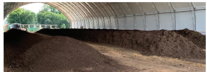
Figure 2: Windrow composting system