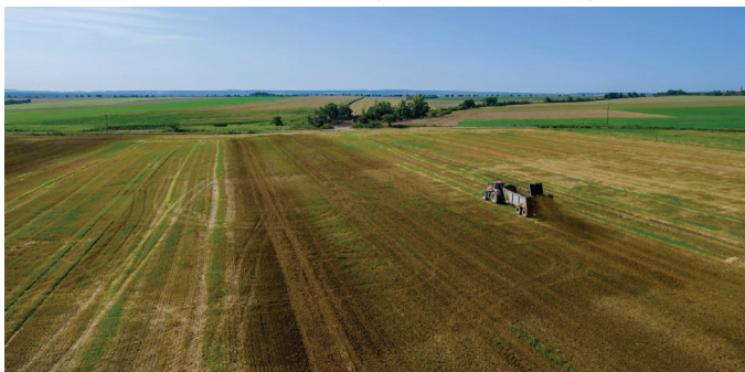
Figure 1: Aerial view of manure application

One of the most important practices when applying compost and solid manure is taking samples for analysis. The greatest barrier to effectively using the nutrients in manure or compost is not knowing what is in the material, and compounding this is the variability of the material itself. “Book values” for nutrients in manure, calculated from the results of many lab analyses, are a place to start, but they may not match what is in your pile or your pit very well. Collecting and analyzing samples from your manure or compost will give you confidence in the nutrient credits for those materials, as analysis results will provide a more comprehensive understanding of the C:N ratio, pH, dry matter, and plant essential nutrients; however, only if the sample submitted to the laboratory represents what is actually applied to your fields. This means understanding the sources of variability in your manure. This factsheet will outline sampling strategies and techniques for compost and solid manure to ensure representative samples.