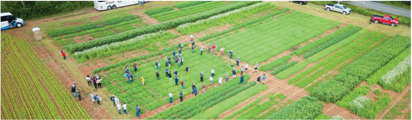
Figure 4. Aerial view of demo area during August 23 rd “The Dirt on Cover Crops” Field Tour. Bare strip down the center of the photo is the Sinbar treatment.