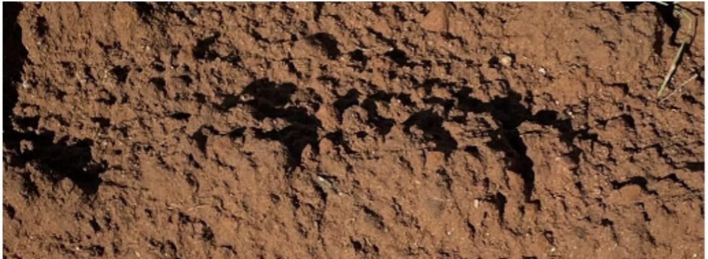
Figure 1. Annual ryegrass establishment on July 27 th , 2022.

Two methods of evaluating cover crop establishment were used. On July 27 and 28 (2 weeks after planting), photos were taken of each plot and uploaded to Canopeo, a tool that measures fractional green canopy cover. Ratings were scaled within each cover crop species, and a heat map was created (Figure 2). On the right side of Figure 2 is an index for cover crop establishment. Closer to zero (blue) meant no cover crop was present. Closer to one (red) meant more vegetative cover was present. As different cover crops will naturally establish at different rates, the data was scaled for within each crop. This means that when looking at Figure 2, cover crops should be compared across herbicide treatments within the same cover crop. Annual and perennial ryegrass results are not depicted as ryegrasses are slowly establishing, and data was poorly captured by the Canopeo app (Figure 1).